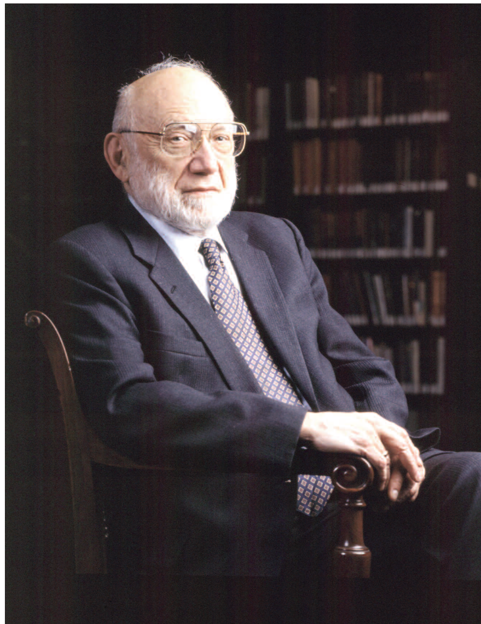
Joshua S. Lederberg, Ph.D. Professor and President Emeritus, Nobel laureate 2002 David Rall Medal, Institute of Medicine