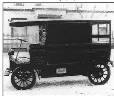
An ambulance used by the Hospital of The Rockefeller Institute (c. 1917), the nation's first center for clinical research.

The exhibit will be open to the public every Friday from 11 a.m. to 2 p.m. The campus community is encouraged to stop by during regular business hours.