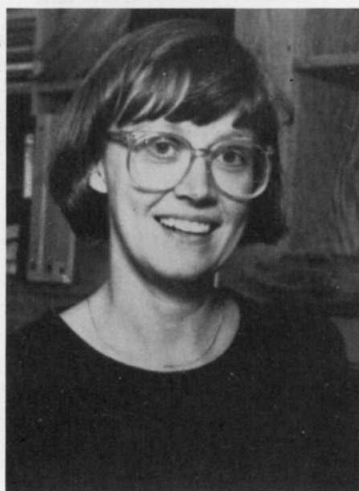
Shirley Tilghman was a member of the advisory committee of the first Women in Science Summit.

in 1975. She was a Fogarty International Fellow at the National Institutes of Health until 1977, then joined the Institute for Cancer Research in Philadelphia, Pa. In 1986, she became Howard A. Prior Professor of the Life Sciences at Princeton University and in 1993, chair of the Council on Science and Technology. Tilghman is an investigator of the Howard Hughes Medical Institute and an adjunct associate professor at the Robert Wood Johnson Medical School of the University of Medicine and Dentistry of New Jersey.